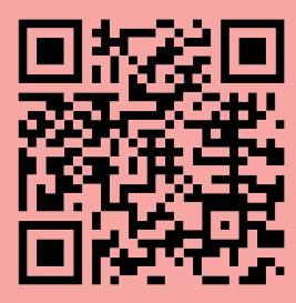
Scan for upcoming workshops